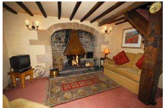
One of the hundreds of places to stay in the UK

"This extra performance of our site is clearly attributable to the speed of the UKFast dedicated, managed server"